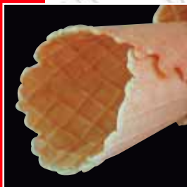
SILEX ® Ice cream cone